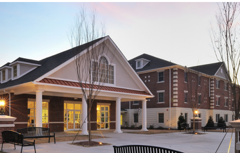
Emmanuel College– Franklin Springs, GA