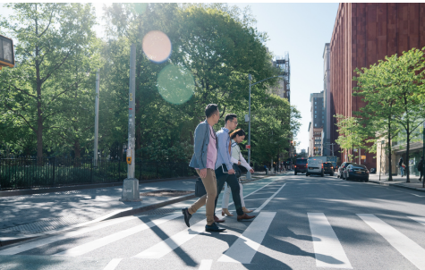
UGA Pedestrian System– Athens, GA