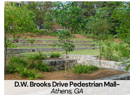
D.W. Brooks Drive Pedestrian Mall- Athens, GA