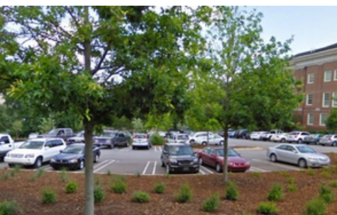
UGA Coverdell Parking– Athens, GA