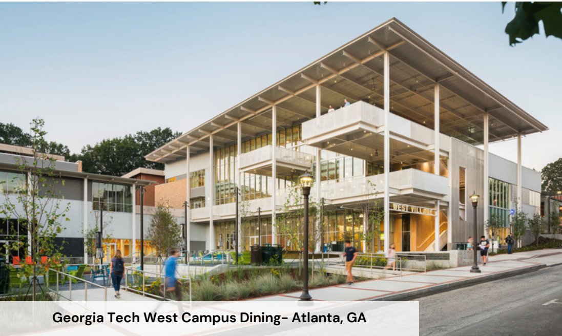
Georgia Tech West Campus Dining- Atlanta, GA