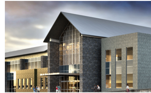
UGA College of Vet Med Traffic Design- Athens, GA

W&A Engineering provides a full range of services within the education industry. Whether designing pedestrian systems, athletic complexes, traffic circulation systems, learning greenspaces, parking lots, or entire college campuses, our team has extensive experience working on successful education projects across the country. Whether our clients are planning an expansion of an existing space, accommodating growth, or designing a whole new campus, W&A's experienced team provides comprehensive total development solutions which includes surveying, site planning and design, master planning, permitting, construction plans, discipline coordination, and construction administration.