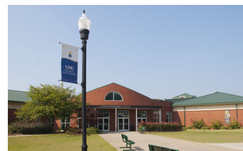
University of North Georgia- Watkinsville, GA and Gainesville, GA