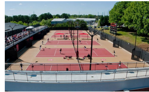
NC State University Club Tennis Complex- Raleigh, NC