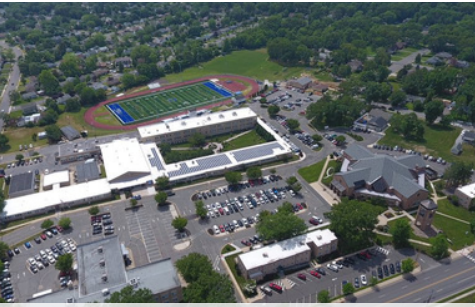
Monsignor Donovan High School – Athens, GA