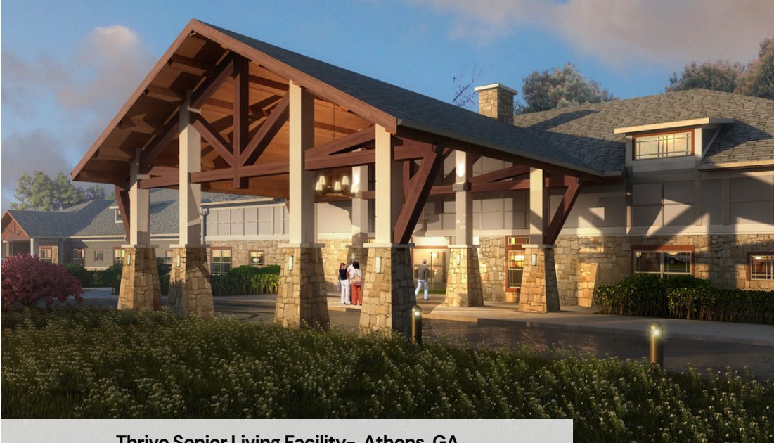
Thrive Senior Living Facility- Athens, GA