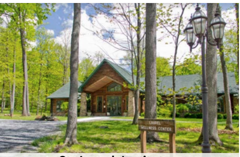
St. Joseph Institute-Port Matilda, PA