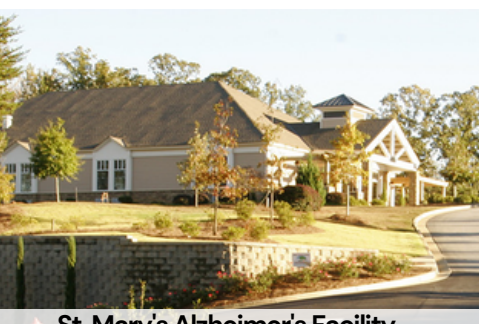
St. Mary's Alzheimer's Facility-Athens, GA