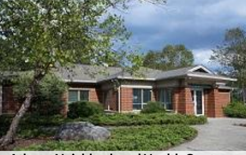
Athens Neighborhood Health Center-Athens, GA