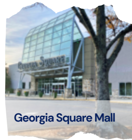
Georgia Square Mall