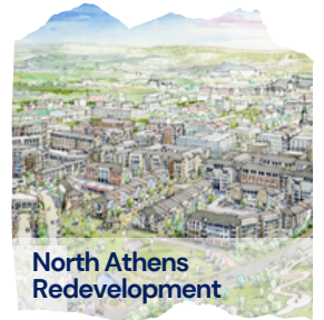
North Athens Redevelopment