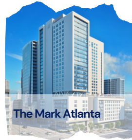
The Mark Atlanta