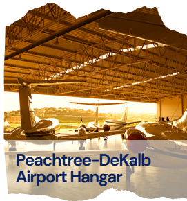
Peachtree-DeKalb Airport Hangar