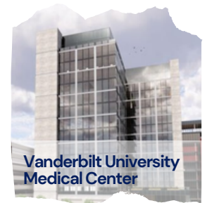
Vanderbilt University Medical Center