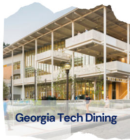
Georgia Tech Dining