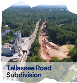
Tallessee Road Subdivision