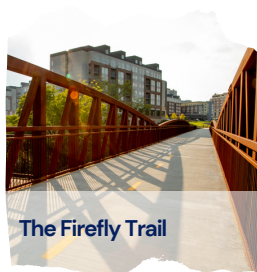
The Firefly Trail