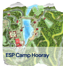
ESP Camp Hooray