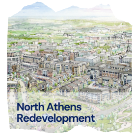
North Athens Redevelopment