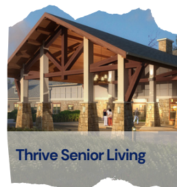
Thrive Senior Living