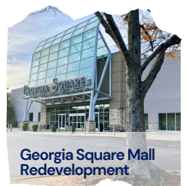
Georgia Square Mall Redevelopment