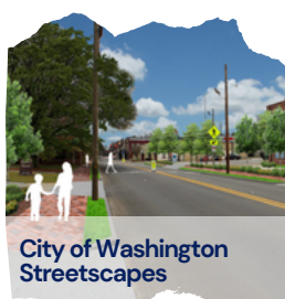
City of Washington Streetscapes