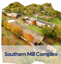
Southern Mill Complex