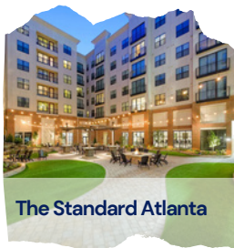
The Standard Atlanta