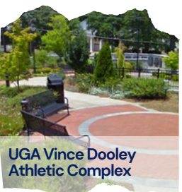
UGA Vince Dooley Athletic Complex