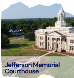
Jefferson Memorial Courthouse