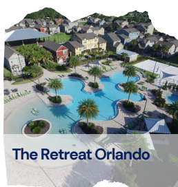
The Retreat Orlando